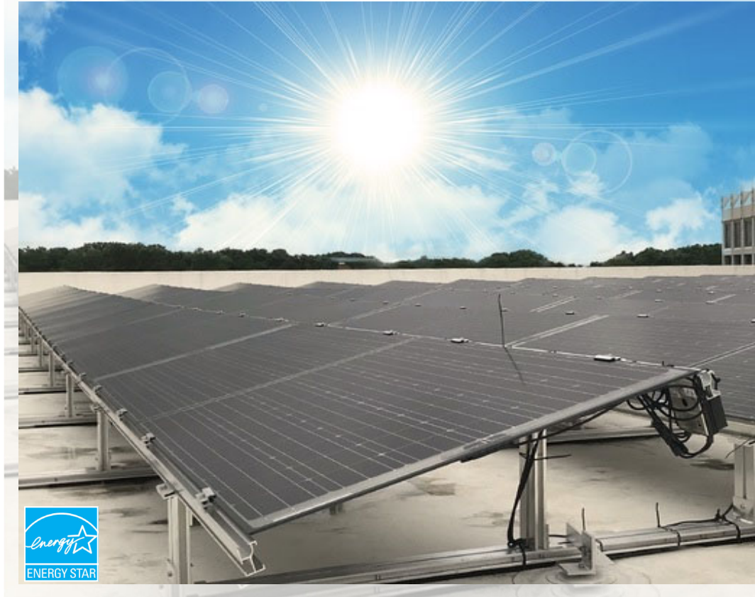
* This marked the first completed C-PACE project in Montgomery County to include solar energy.